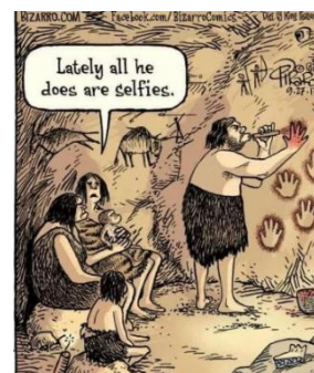
Art Appreciation: First Thursday of the Month!